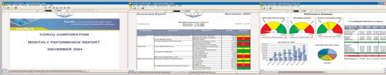
Online executive portfolio provides a graphical snapshot of the business

CorVu...Drive Efficiencies, Drive Priorities, Drive Performance