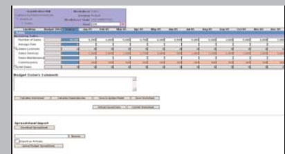
Report with embedded graph in group footer