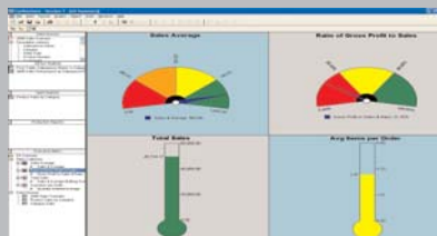
Dashboards of key performance indicators