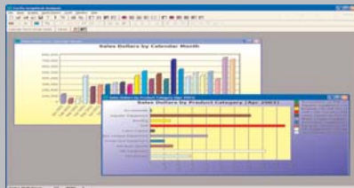
Graphing capability supports pre-defined drill-down scenarios and ad-hoc analysis